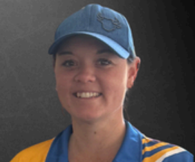
Bolivia Millerick Ladies Open Team